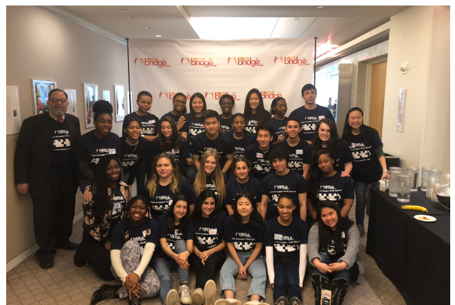
Above: photos from Youth Summit 2018

Students and teachers will reconvene in their own groups and start identifying which issue they want to address. What are some of the most important issues that affect them? Students and teachers will plan out a few of their ideas and goals and then head out of the conference with the knowledge, skills, and inspiration to make a change in their schools and/or communities.